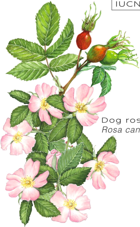
Dog rose Rosa canina