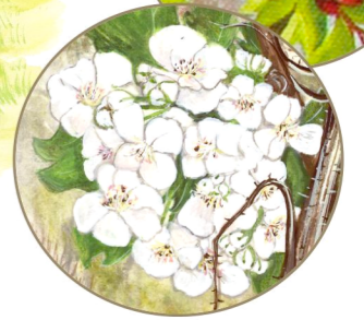
Hawthorn Crataegus monogyna