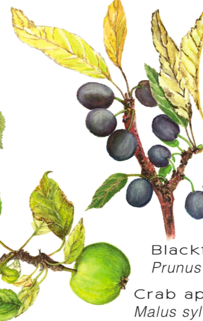
Crab apple Malus sylvestris