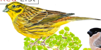
Yellow hammer IUCN Red List