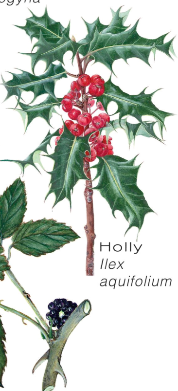
Holly Ilex aquifolium