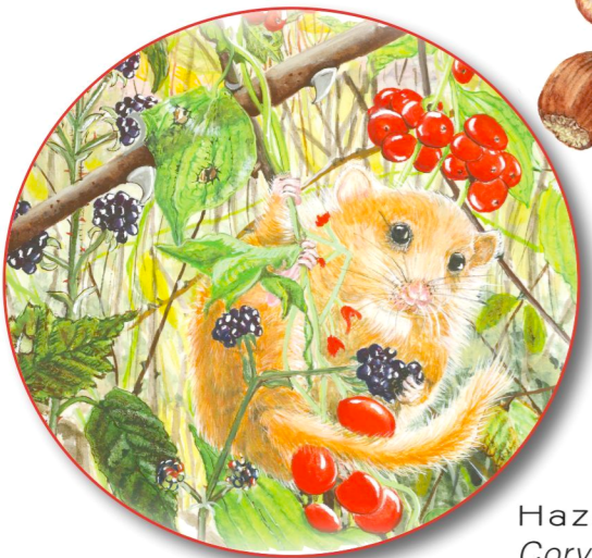
Hazel Corylus avellana

Hedgerows are dispersal corridors for dormice, allowing movement between woodlands. They feed on the variety of flowers, nuts and berries produced by the hedgerows throughout the seasons of the year.