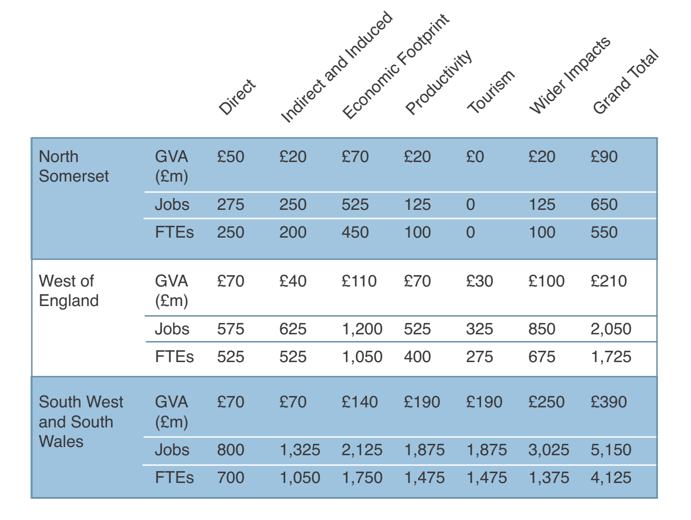
Table 5 represents the results, presented in the same format as Table 4, with the factors identified in this review accounted for, where possible. This includes: adjusting the Tourism Impact to account for the lower spend for tourists in the South West; assuming a high level of displacement for the Indirect and Induced impact in the South West and South Wales study area; and assuming total displacement for the productivity gain, in line with the DfT's Guidance.

Table 4: Reproduction of the Economic Impact of Bristol Airport in 2026 – Impact of the 12 mppa (million passengers per annum) Planning Consent from the Assessment<sup>1</sup>